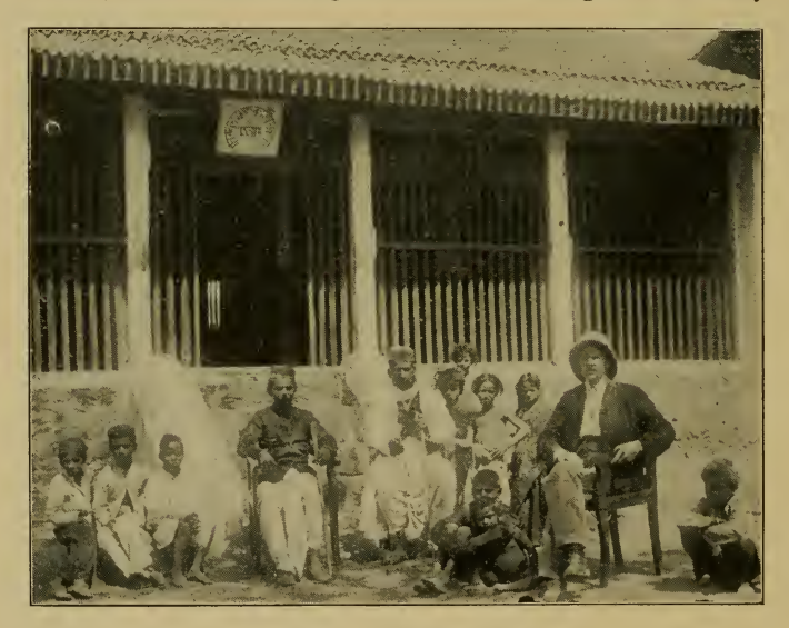
SCHOOL AT NAVAPUR.

SUNDAY SCHOOL.—Thus they toil on content with their lot. But they seem to think that they must work on Sunday also, for although some acknowledge the sanctity