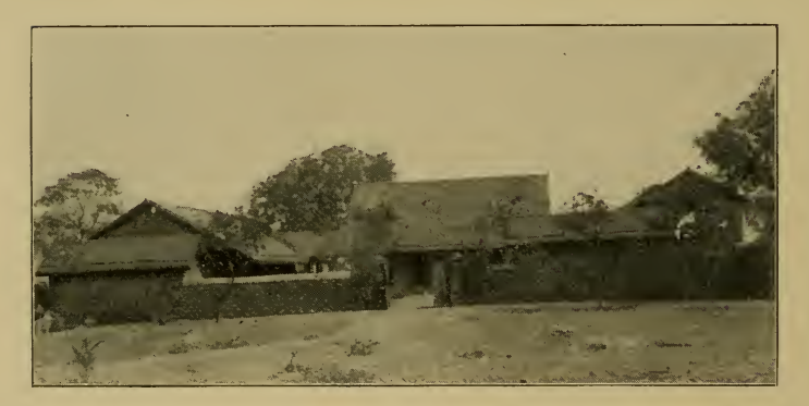
THE KACHERI-GOVERNMENT BUILDING.

to all the backward classes. Revenue waste land is being reserved in those parts where they dwell or are likely to dwell. This land is available for tenancy, but not for ownership. These regulations are called the New Tenure, the chief conditions being first that an occupancy price be paid by the applicant. This is usually the assessment once in advance. When this has been paid the applicant is entered as a tenant. He then enjoys the privilege of raising small loans from the Government on good security. These loans are called Tagai and must be