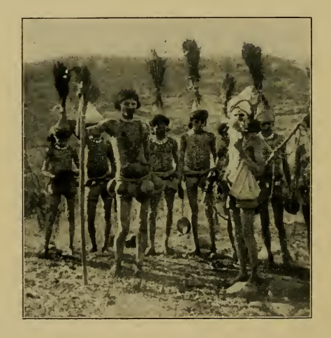
DANCING BHEELS AT HOLY FESTIVAL.

said. Before going to sleep I ate a meal of coarse rice served in a bowl without anything with which to eat it save my fingers, and nothing to eat with it. We rose up early in the morning, walked across the fields to the outskirts of the forest and there found a blue bull as expected. I shot the beautiful bull to the great delight of the Bheel people, who soon provided a cart and brought it to the village. This village was situated close to a big forest, where many tigers and leopards roam. As the